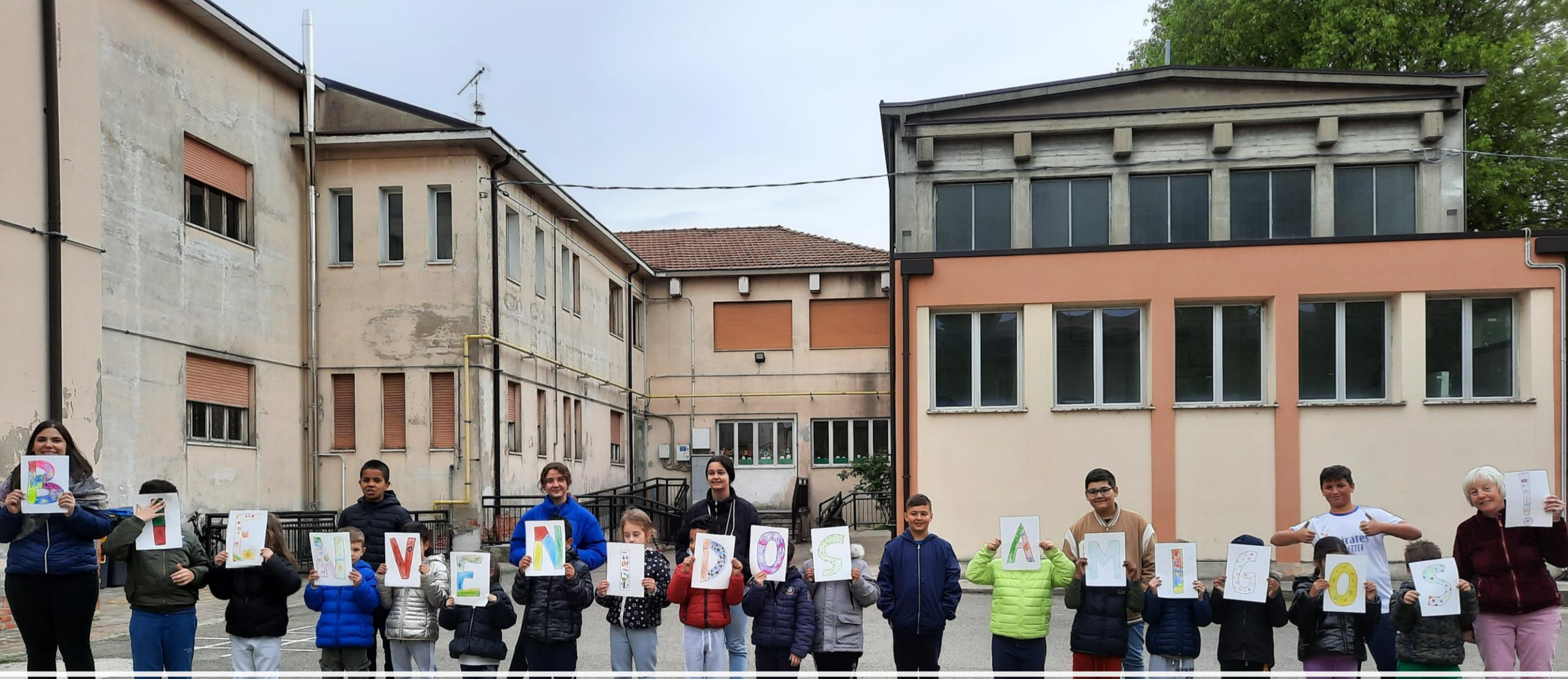
Welcome in Vittorino school