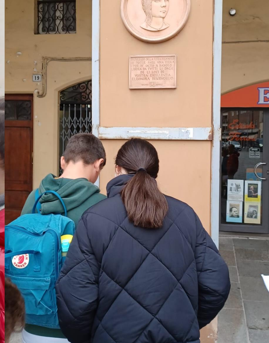
Treasure hunt in Sassuolo