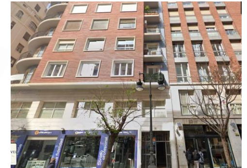
Europass Teacher Academy