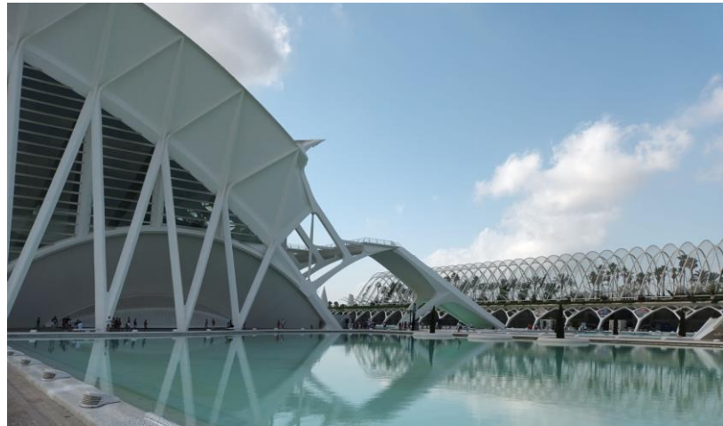
City of Science by architect Calatrava