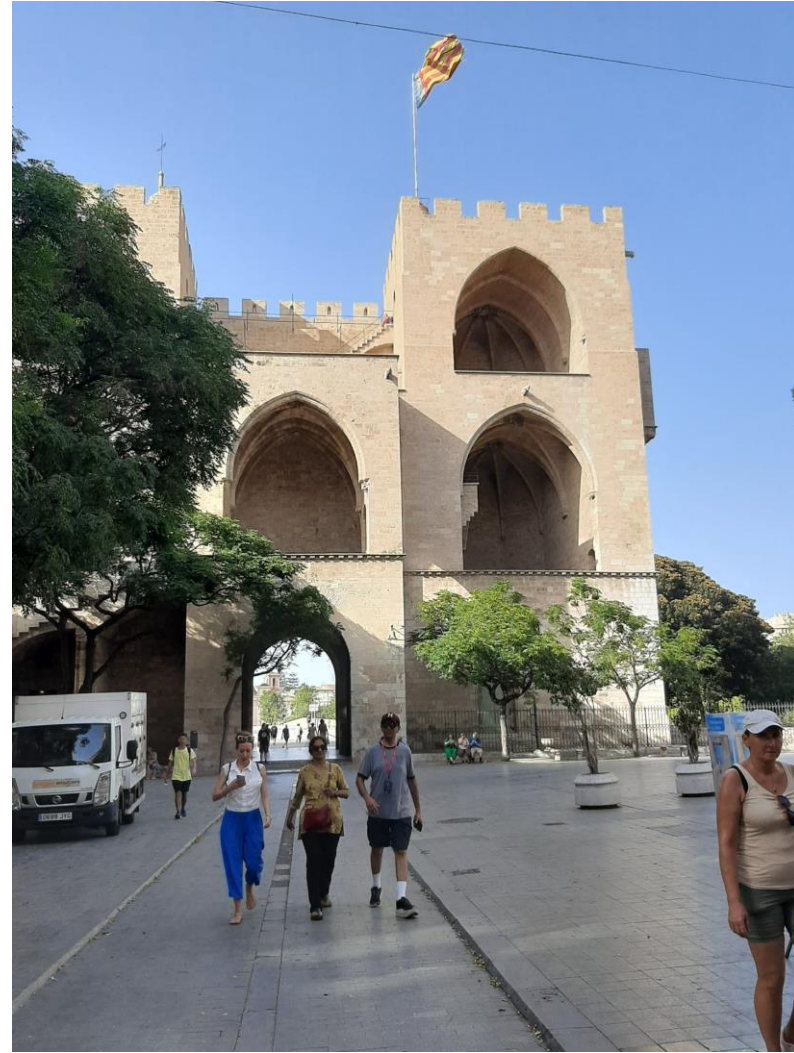
Torres de Serrans